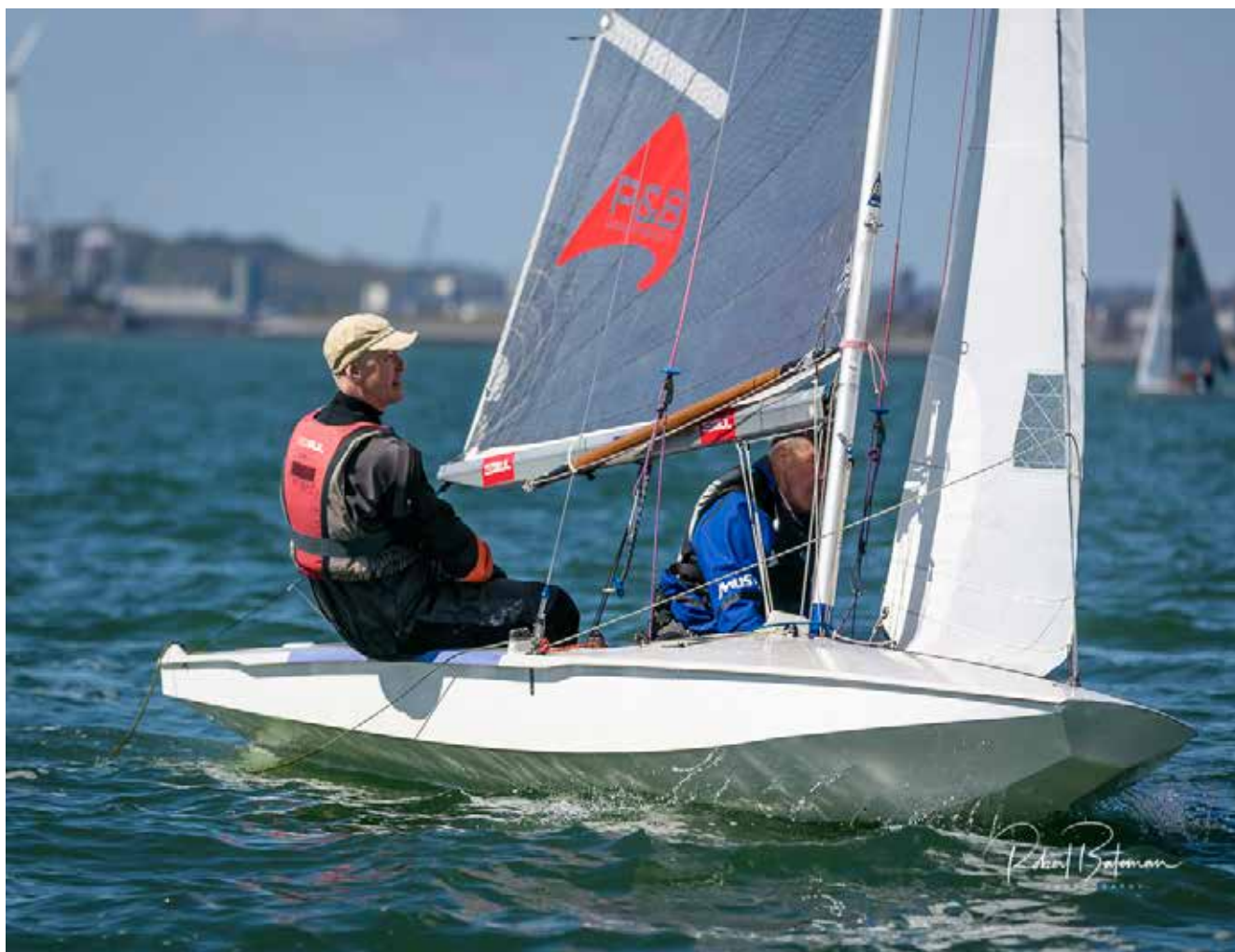
DBSC dinghy racing featuring the Fireball