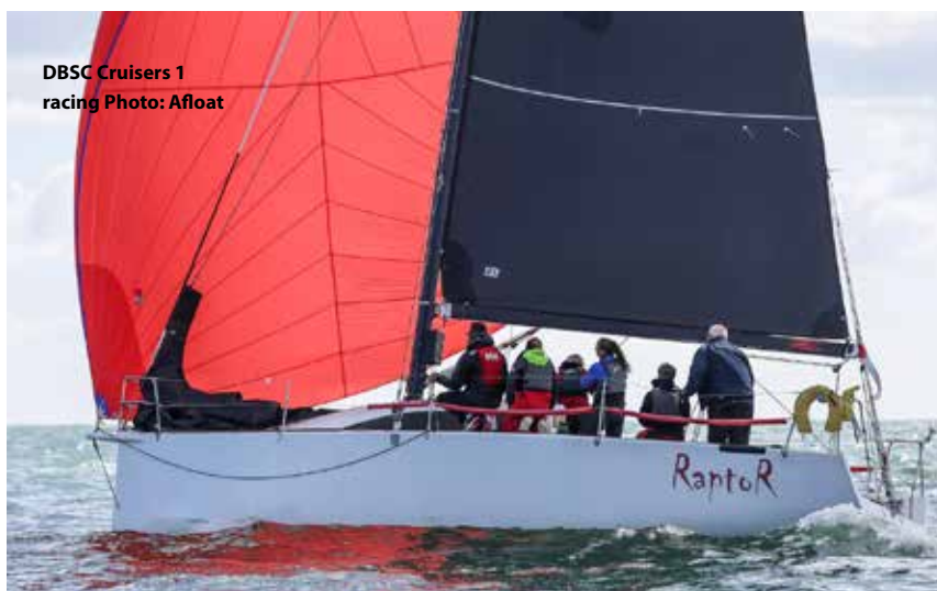
DBSC Cruisers 1 racing