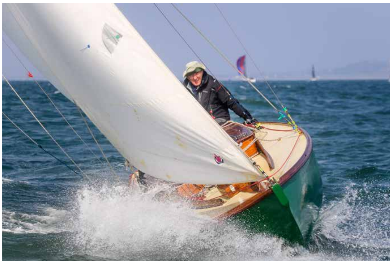
Glen racing