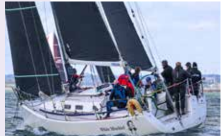
From left: DBSC Dragon class, Cruiser Zero and Cruiser One on Dublin Bay.

Welcome to the AIB DBSC 2025 summer season.