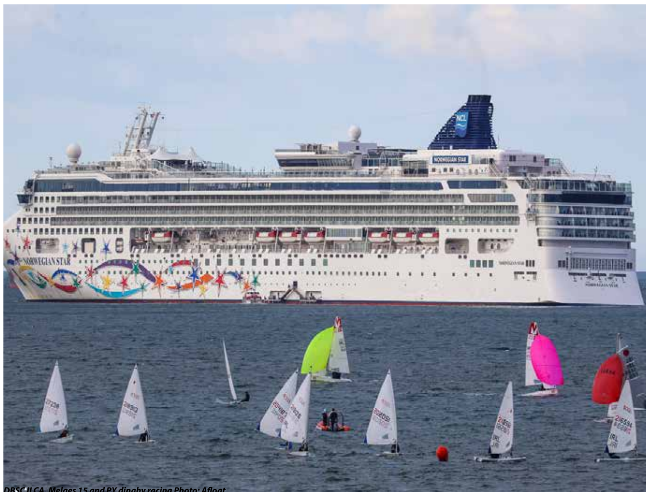
DBSC ILCA, Melges 15 and PY dinghy racing

the change will be signalled in accordance with RRS 33. The new mark may be a different shape or colour. If a different shape or colour is used and a subsequent change takes place the original mark will be used.