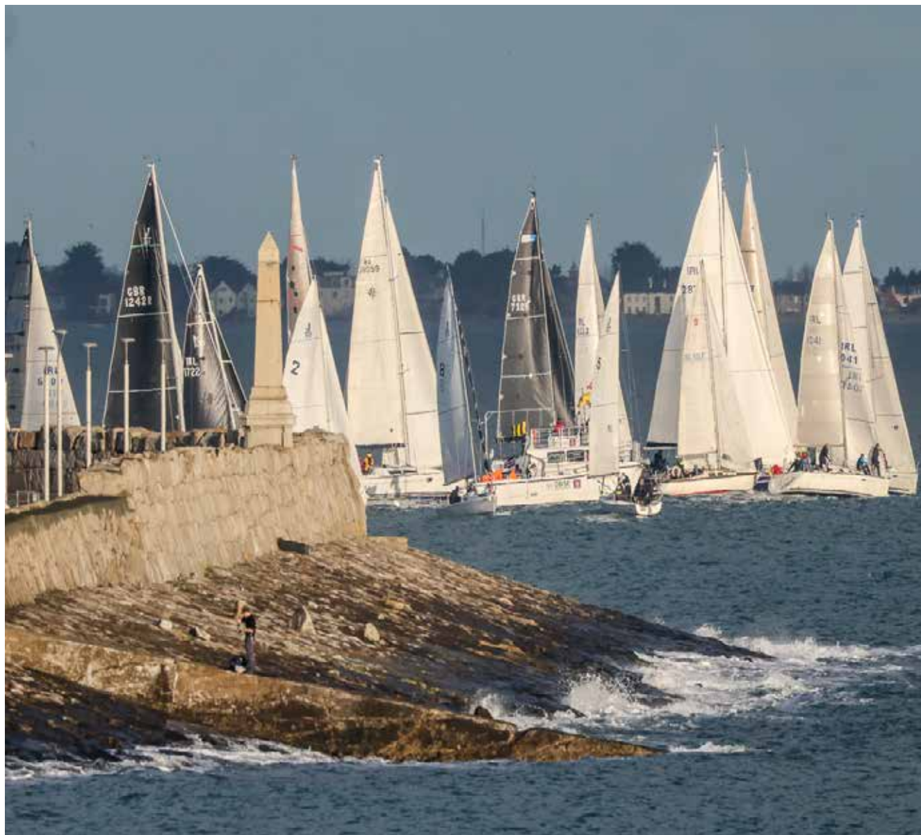
DBSC Cruiser racing off Dun Laoghaire's East Pier

7.1 In a one design class the time limit for the first race of the day shall be 70mins. Should any boat of the class finish within the 70 Mins the time Limit shall be extended to 80mins or 10 Minutes after the second