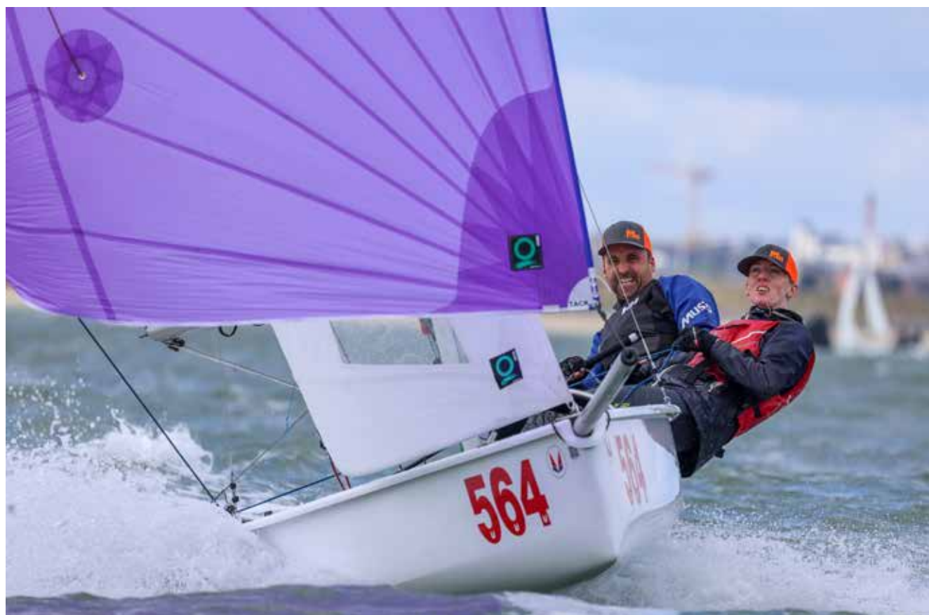
Melges 15 racing